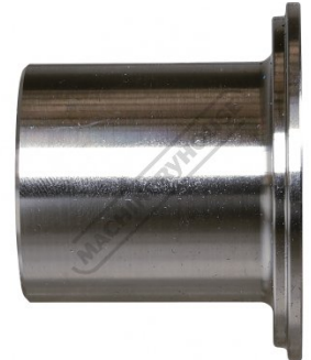
Inside Tipping Die Side View (C)