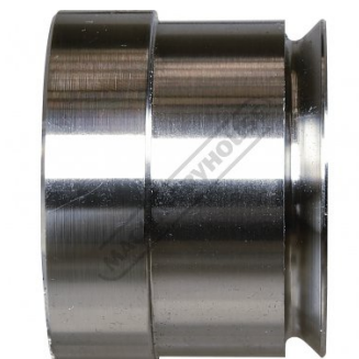
Lower Edge Forming Die Side View (F)