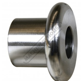
3/8 Inch Tipping Die (G)