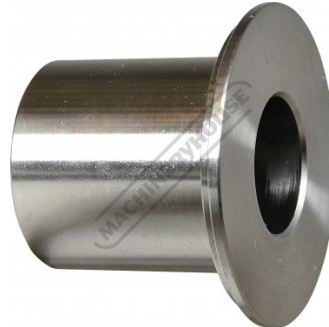
Inside Tipping Die (C)