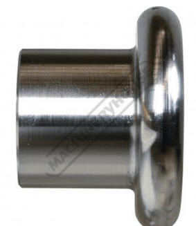
3/8 Inch Tipping Die Side View (G)