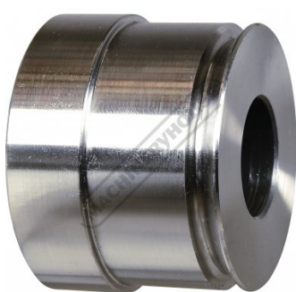
Lower Edge Forming Die (F)