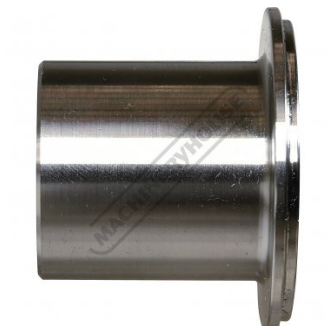
Outside Offset Die Side View (D)