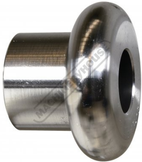
1/2 Inch Tipping Die (H)