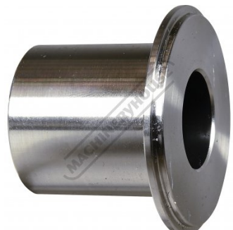
Outside Offset Die (D)