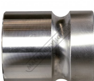
180 Degree Lower Die Side View (B)