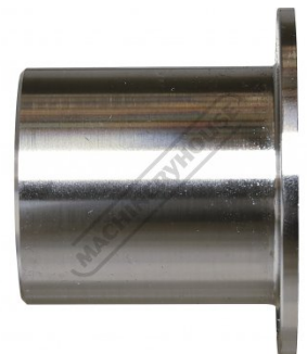
Knife Edge Tipping Die Side View (E)