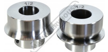
1/2" Die Set