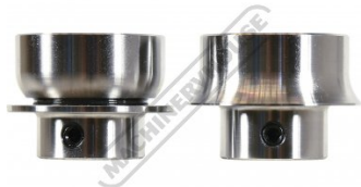
1/2" Die Set Side View