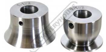
1-1/2" Die Set