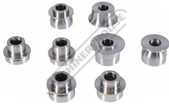
Set Rear Side