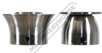
1-1/2" Die Set Side View