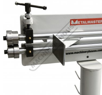
Right Side View Mounted On Machine