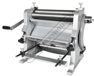
Rear View Rolls Showing