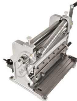
Removable top roller