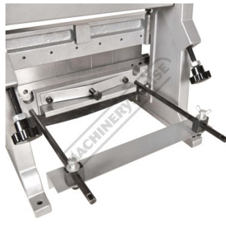
Guillotine Back Gauge