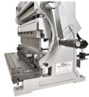
Pressbreak Guillotine Setup