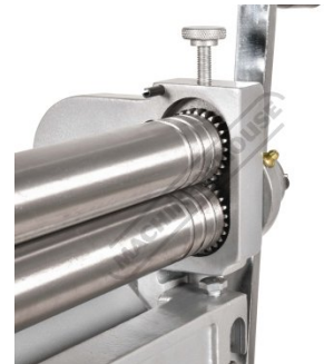
Geared Roll Drive