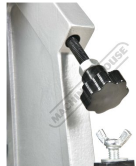
Rear Curving Roll Adjustment Handle