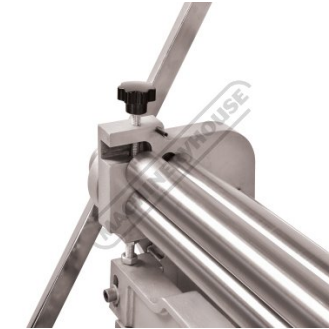
Roll Housing Lock