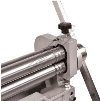
Geared Drive Rolls