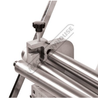
Quick Release Top Roller