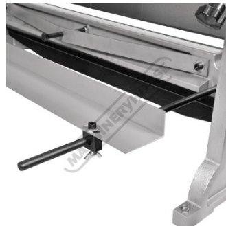
Adjustable Rear Gauge