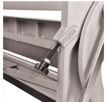
Rear Curving Roll Adjustment