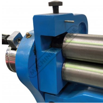
Solid End Housing & Top Roller Lock