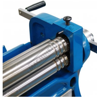
Wire Grooves Rolls