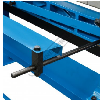
Adjustable Rear Stop