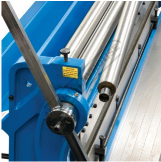
Drive Crank Handle