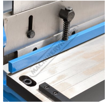
Material Clamp For Shearing