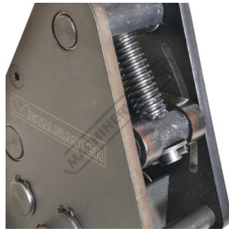
10mm Steel Plate Frame