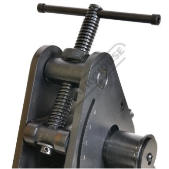
Adjustment Leadscrew With Locking Nut