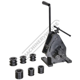
Wire Dies And Tube Rolling Dies Included