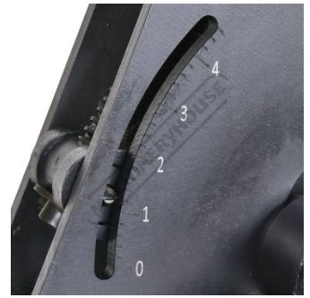
Position Indicator Laser Engraved