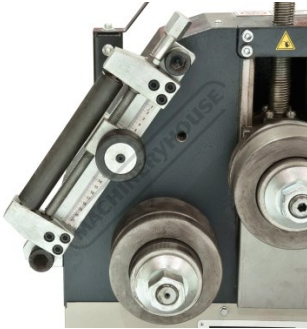
Shown On Machine