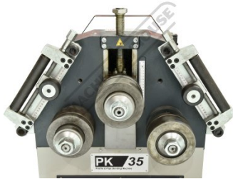
Pair Shown On Machine