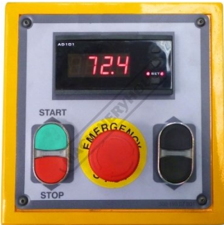
Controller Top View New