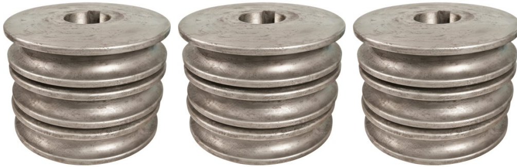
S757J 2" Pipe (NB) Roll Dies