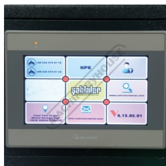
NC Control HPK Information Screen