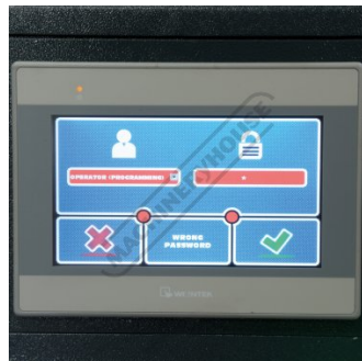
NC Control User Screen