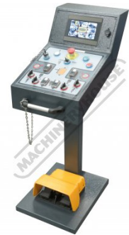
Roving Foot Pedal Controller