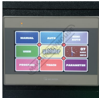
NC Control Main Screen