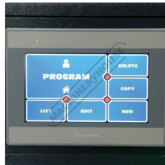
NC Control Program Screen