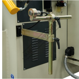
Material Length Reference Proximity Switch