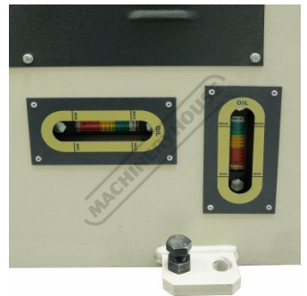
Oil Sight Glass