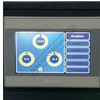
NC Control Manual Mode Screen