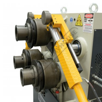
2-Axis Hydraulic Right Lateral Angle Guide Rollers