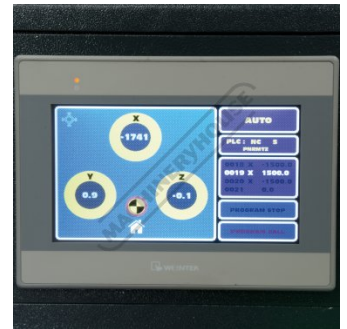
NC Control Auto Screen