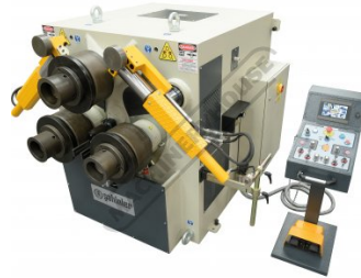
Top View - Right Side