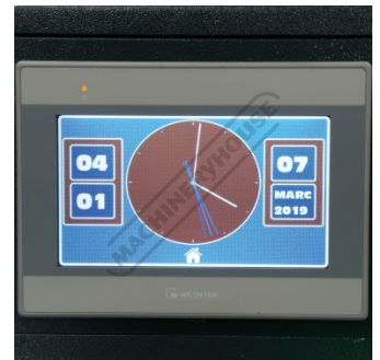
NC Control Time & Date Screen