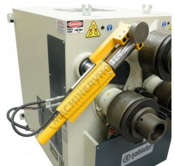
2-Axis Hydraulic Left Lateral Angle Guide Rollers