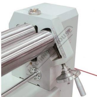
Curving Roller Height Adjustment Right Side