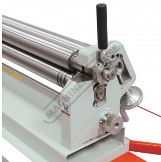
Right View of Rolls