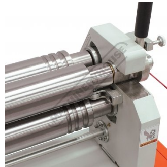
Wire Groove Rolls