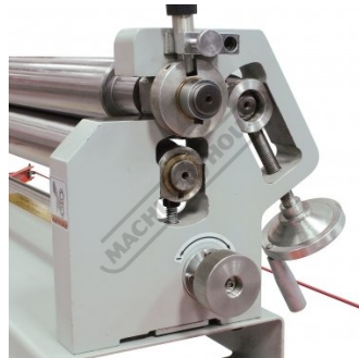
Material Thickness and Curving Roller Adjustment