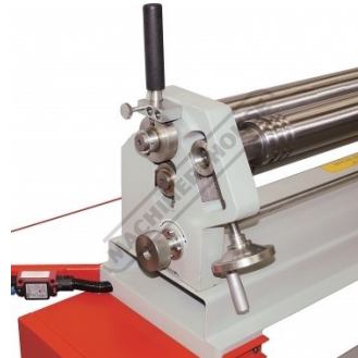
Rear View of Curving Roll Adjustment