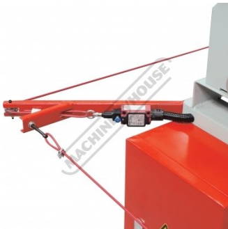
Safety Trip Wire Micro Switch