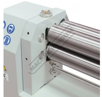
Left View of Rolls