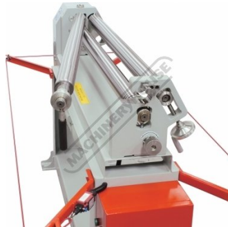
Swing Out Top Roller