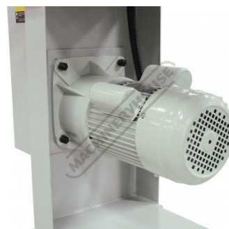
Main Drive Motor