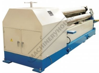
Left Rear View