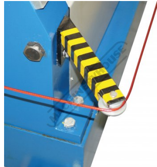
Safety Wire Interlock System