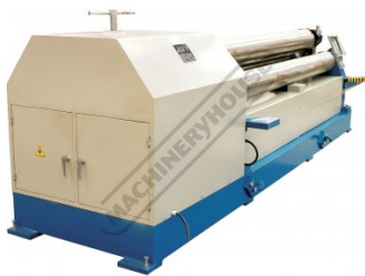
Left Rear View