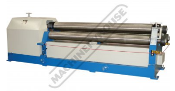
Rear View New