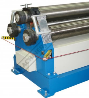
Section Roll End with Flat Bar and Pipe Dies