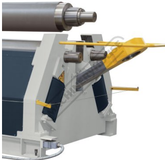
Standard Hydraulic Drop End