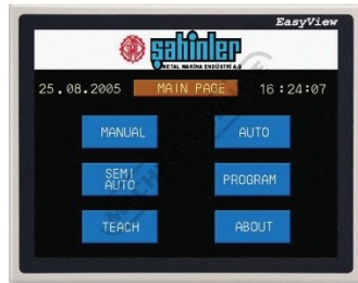
4-Axis CNC Controller Main Page