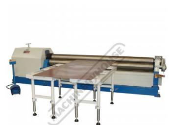
Shown with Optional Ball Transfer Tables