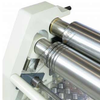
Wire Groove Rolls Rear View