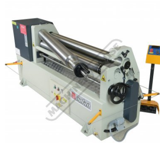
Swing Out Top Roller