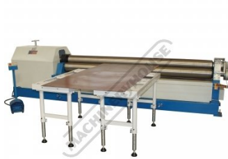
Shown with Optional Ball Transfer Tables - Order Code (L840)