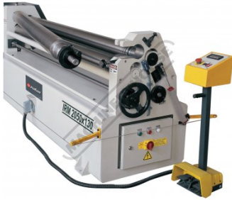
Standard Manual Drop End