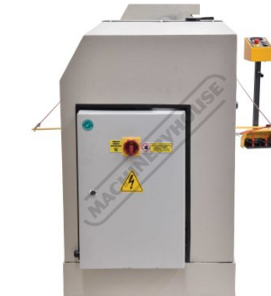
Left End View