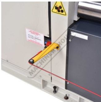
Safety Wire Interlock System