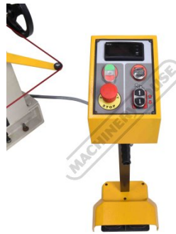
Roving Pendant Controller