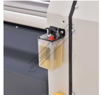
One Shot Lube Pump