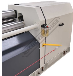
Head Rear View