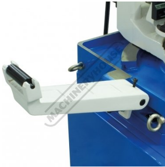
Material Support Arm