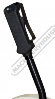
Safety Trigger Switch