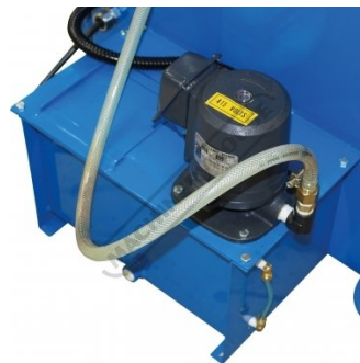
Coolant Pump and Tank