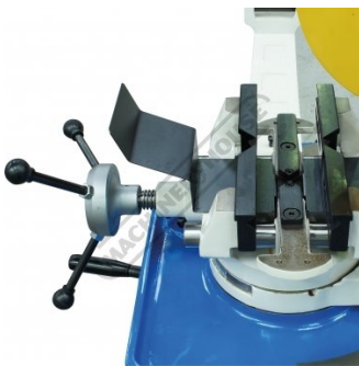
Self Centering Vice Side View