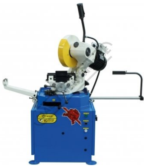
Front View Swivel Head