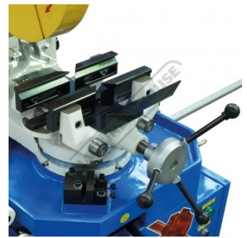
Self Centering Vice