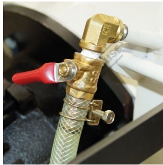
Coolant Flow Valve