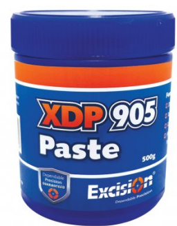
S074 Cutting Tool Lubricant Paste - 500g