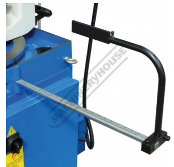
Adjustable Length Stop