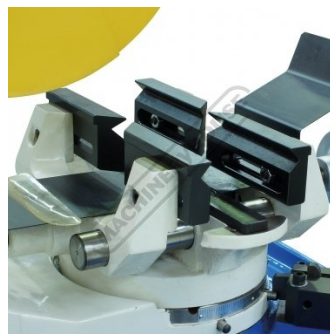
Adjustable Vice Jaws