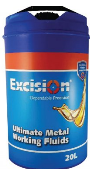
S091 Soluble Metal Cutting Fluid - 20 Litre