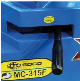
Swivel Head Release Lever