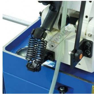
Head Return Springs