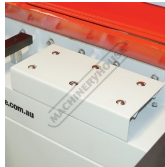
Material Transfer Balls on Table