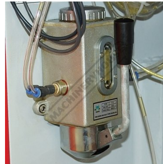
One Shot Lubrication