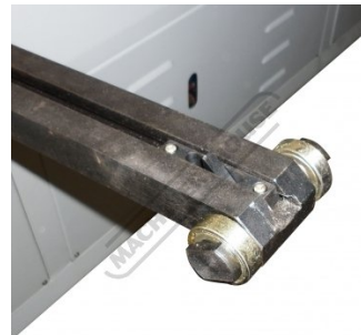
Front Sheet Supports with Roller Bearings