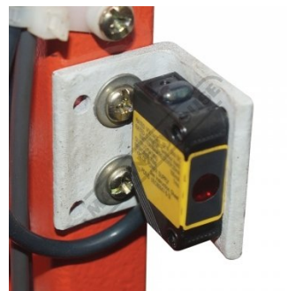
Safety Omron E3ZS Rear Light Sensor Guarding