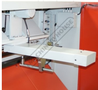
Motorised Backgauge Close Up