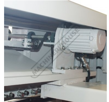
Back Gauge Drive Motor