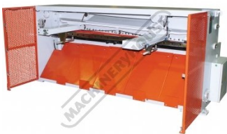
NC-89 Control Backgauge