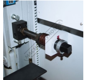
Quick Action Blade Clearance Adjustment