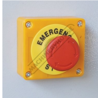
Emergency Stop Switch