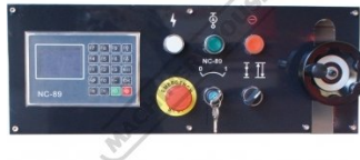
NC 89 Control Panel