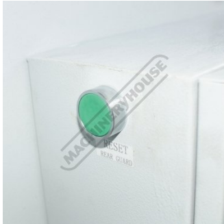
Rear Guard Reset Button