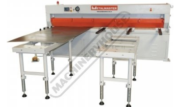
Shown with Optional Ball Transfer Tables - Order Code (L840)