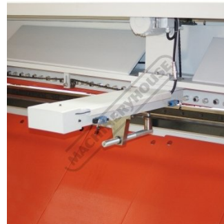
Motorised Backgauge Right View