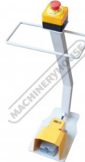
Mobile Foot Control