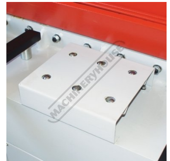
Material Transfer Ball On the Table