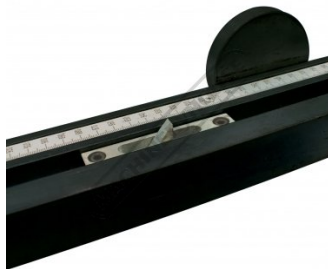
Squaring Arm with Flip Over Stop