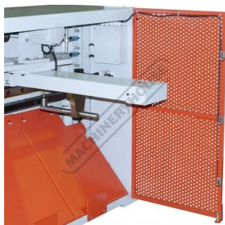
3 Safety Photo Sensors