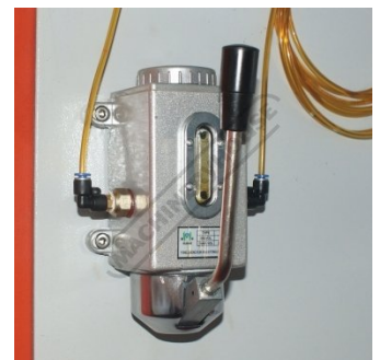
One Shot Lubrication