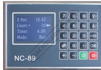
NC 89 Backgauge DRO