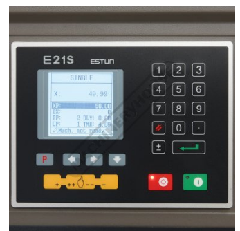
Estun E21S Controller