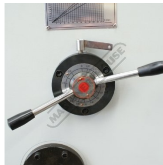
Blade Clearance Adjustment Lever