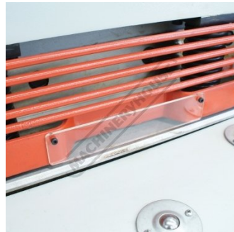
See Through Safety Guard