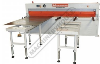
Shown with Optional Ball Transfer Tables - Order Code (L840)