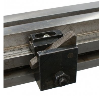
Flip Over Material Stop