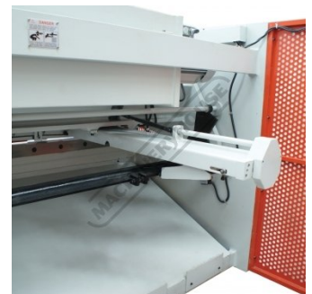
Motorised Back Gauge