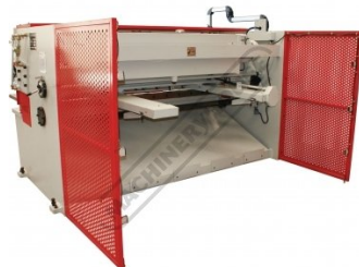
Rear Guarding View