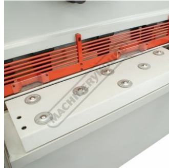
Material Transfer Balls On The Table