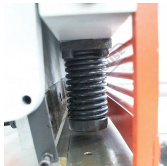
Hydraulic Material Hold Downs