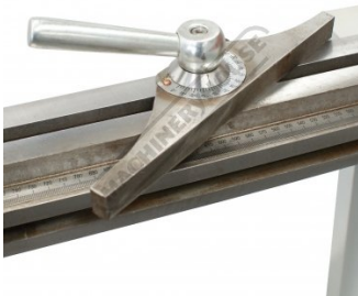
Adjustable and Sliding Mitre Guide