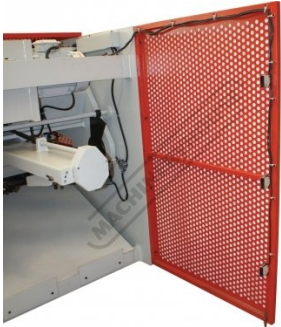
3 x Photo Electric rear guarding