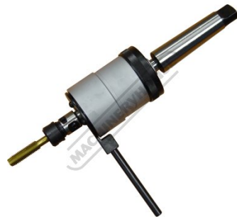
Shown With Tapper