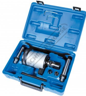
Blow Mold Case