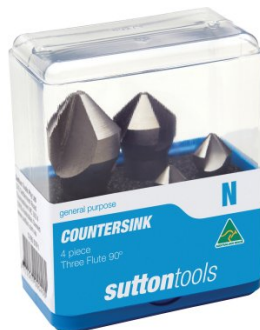
D106 Countersink Sets – 90° Three Flute