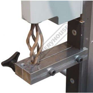
Shown Twisting Multiple Bars