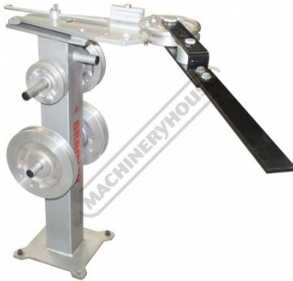
Shown on Optional Stand