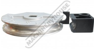
Former & Follower Die Side View