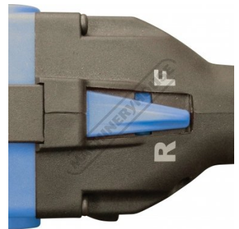
Forward Reverse Switch