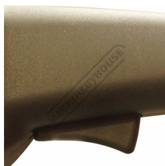
Bending Trigger Switch