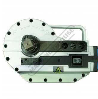
Main Body Top View