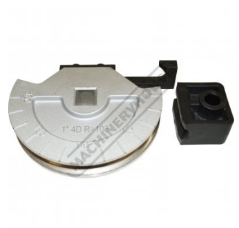
1" Inch Former & Follower Die