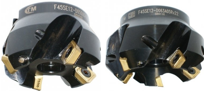
M516 Face Mill 45° - Super High-Rake