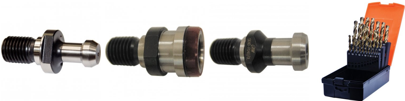
D1282 Imperial 135° Precision HSS Drill Set - 29 Piece