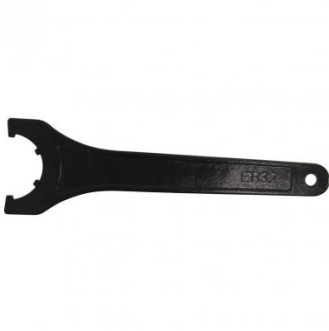
C932 ER32 Collet Chuck Wrench