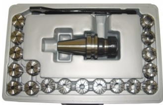
C929A Collet & Chuck Set - 20 Piece