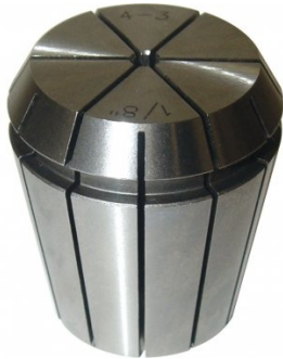
C934 ER40 Collet