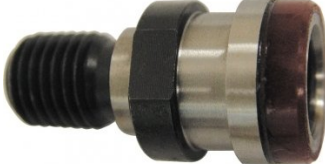
T144 Pull Stud