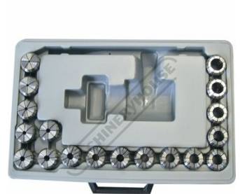
C922 ER32 Collet Set - 18 Piece