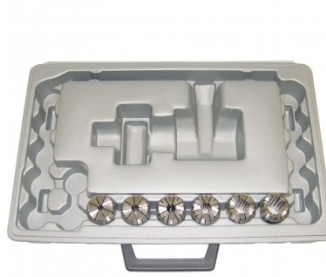
C921 ER32 Collet Set - 6 Piece