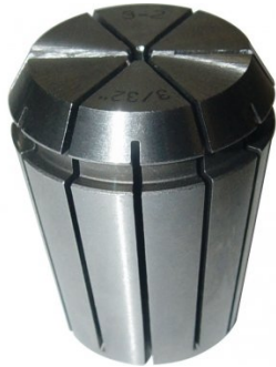
C903 ER32 Collet