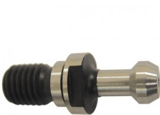
T330 Pull Stud