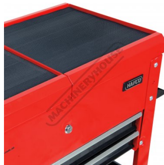
Protective Top Liner