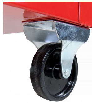
2 x Fixed Wheels