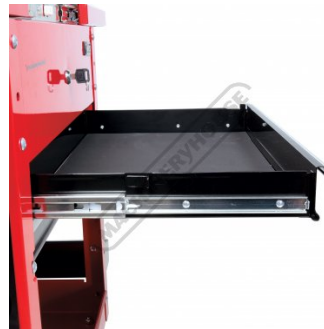
Drawer with Ball Bearing Slides