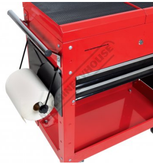
Paper Towel Holder