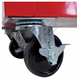
2 x Swivel Brake Wheels