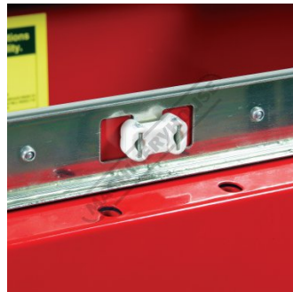
Detent Lock On Top Lid