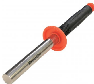
L300 Magnetic Swarf Remover