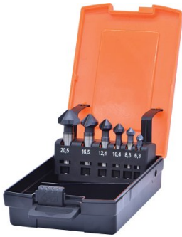
D1061 HSS Countersink Set (90° 3 Flute Type) - 6 Piece