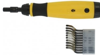
D060 Deburring Tool - Telescopic Shaft