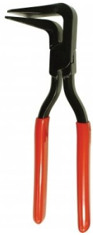
S205 90° Edge/Seaming Plier