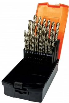
D1282 Imperial 135° Precision HSS Drill Set - 29 Piece