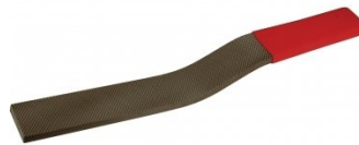
F160 Slapping File - Second Cut