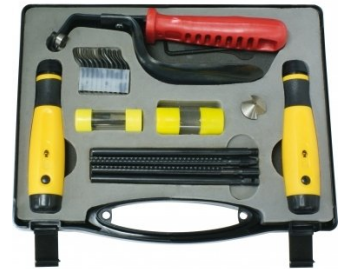
D065 Universal Deburring Tool Set - 23 Piece