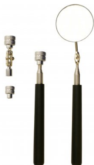
M0009 Magnetic Pick Up Tool & Inspection Mirror Set