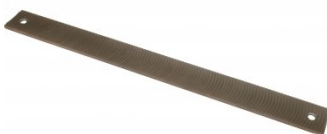
F155 Flexible Body File