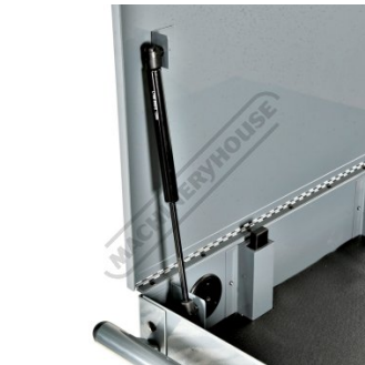
Gas Strut Lid