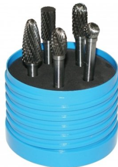
B900 Carbide Burr Double Cut Set - Short Series