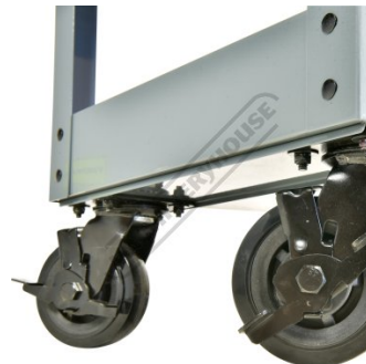
Wheels With Brake System