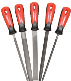
F100 Engineers Files, 5 Piece Set - Second Cut