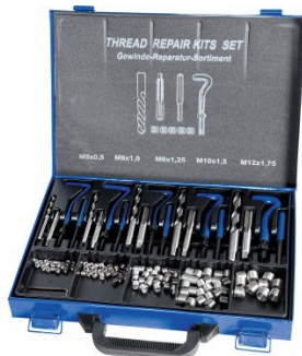
T100 Metric Thread Repair Kit - 130 Piece