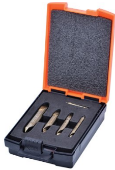
D508 HSS Industrial Centre Drill Set – 5Pcs