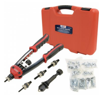
N001 Nut & Blind Riveter Set - 130 Piece