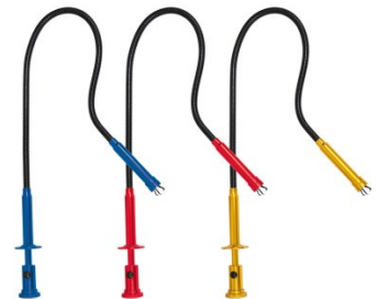
M0010 Pick Up Tool with Magnetic Head & 1 x LED Light