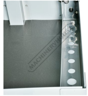
Internal Screwdriver Storage