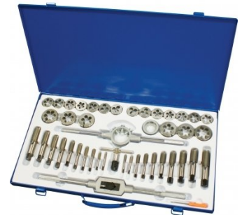
T016 Metric HSS Tap & Die Set - 45 Piece