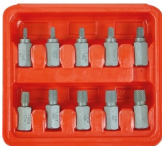
T870 Screw Extractor Set - 10 piece