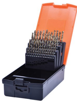
D1285 Metric 135° Precision HSS Drill Set - 51 Piece