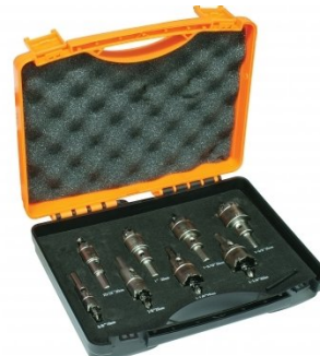
D108 Metric Carbide Tipped Hole Saw Set