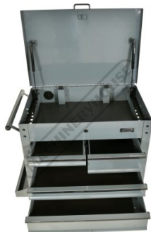
Protective Draw Lining