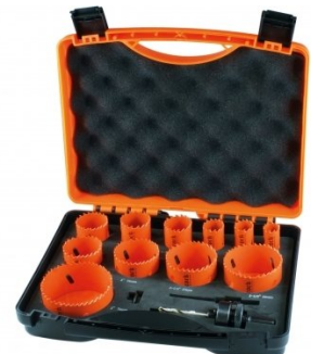
D102 Metric HSS Hole Saw Set