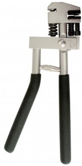
S200 Joggler & Punch Plier