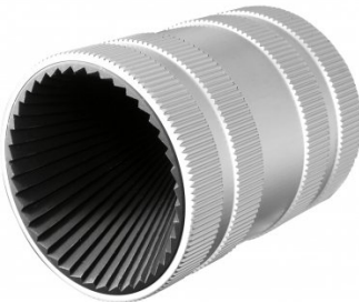
D068 Pipe/Tube Deburring Tool - Internal / External