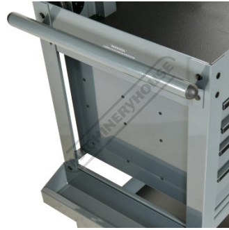
Cart Handle-Side Tray