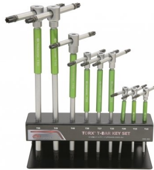
H822 Torx® Key Set with T-Bar Handle