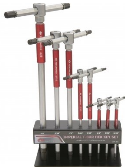
H821 Imperial Hex Key Set with T-Bar Handle