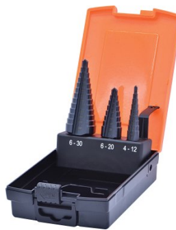
D1071 HSS Sheet Metal Step Drill Set - 3 Piece