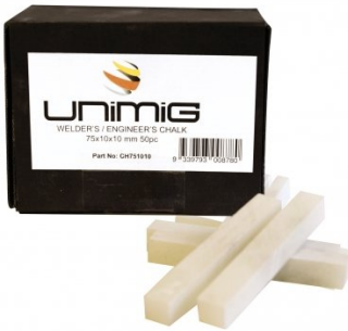
W103 Engineers Chalk Marker- 50 Splits