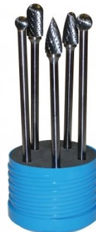
B905 Carbide Burr Double Cut Set - Long Series