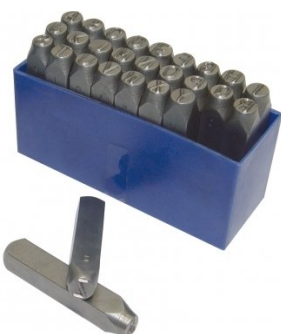
P350 Letter Punches