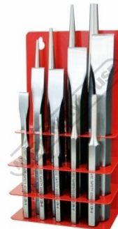
P364 Punch & Cold Chisel Set - 14 Piece