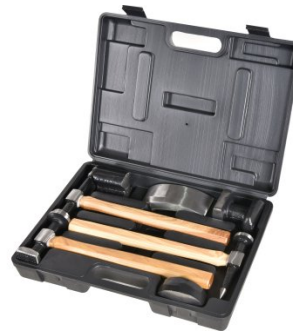
H885 Auto Panel Restoration Kit - DIY