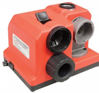
D070 Drill Sharpener