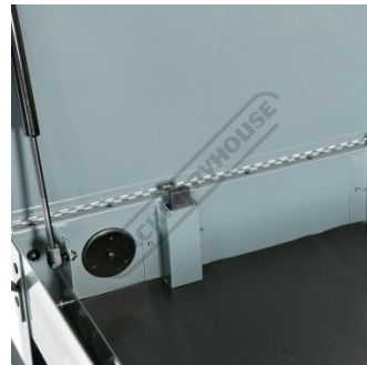
Draws Lock When Lid Closed