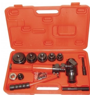
P020 Hydraulic Chassis Punch Set