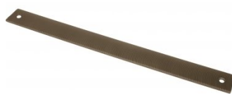
F156 Flexible Body File