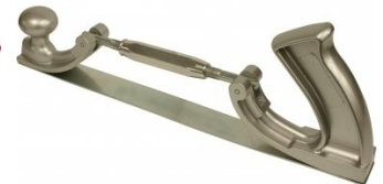
F150 Flexible Body File Holder