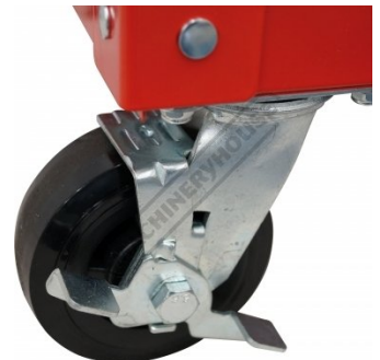
2x Swivel Brake Wheels