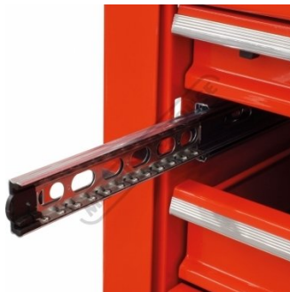
Ball Bearing Drawer Slides