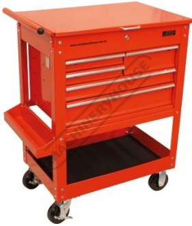
Left View with Lid Closed