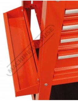
Side Storage Tray