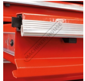
Safety Drawer Latches