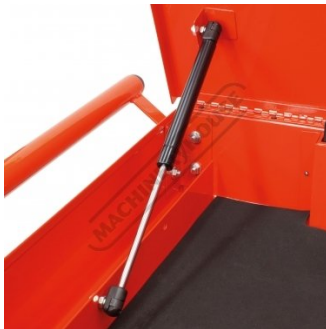
2 x Lid Gas Strut Supports