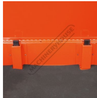
Drawer Locking System