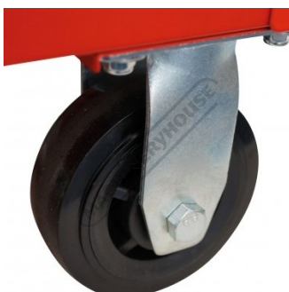
2x Fixed Wheels