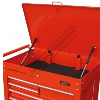
Top Storage Compartment