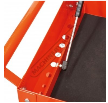
Internal Side Screwdriver Storage Bay