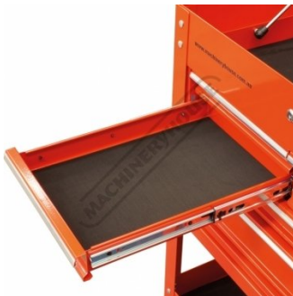
Drawers With Protective Liners