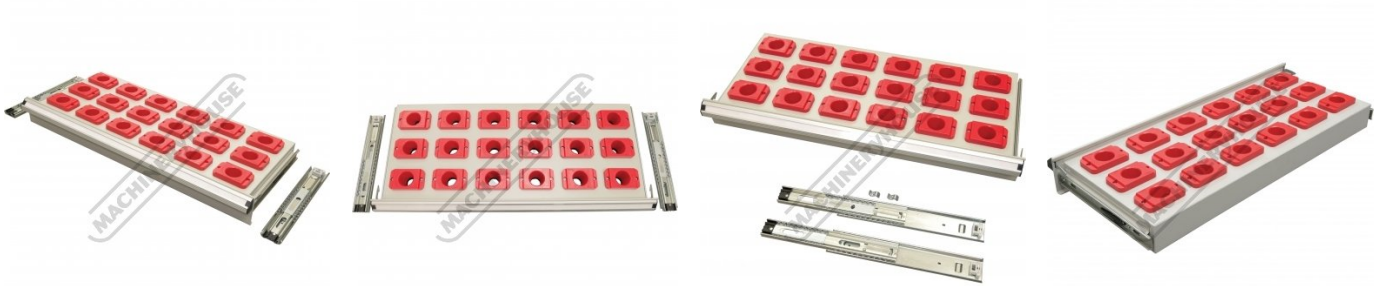
Right Top View