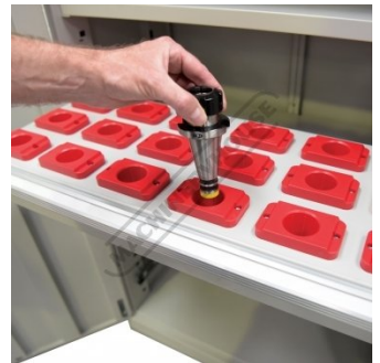
Shown Inserting NT40 Tooling