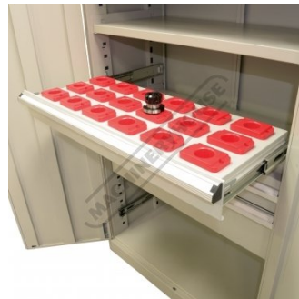
Shown Mounted To Optional Cabinet 2