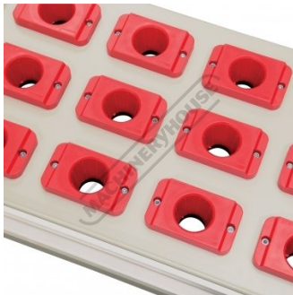
NT40 BT40 Tool Holder