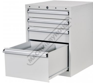
Large Lower Draw