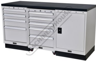
Optional Combination Setup