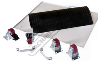
Optional Wheel-Handle Kit (T7689)