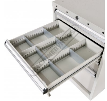
Draws With Adjustable Steel Dividers