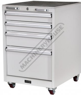
Shown With Optional Wheel Kit