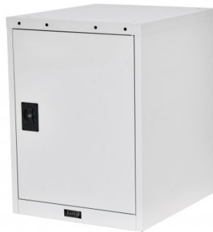
T7680 Tooling Cabinet