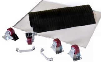
T7689 Cabinet Trolley Kit