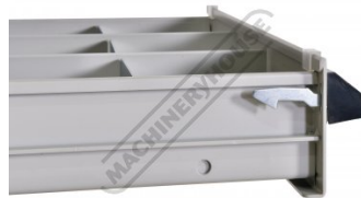
Safety Lock On Draws