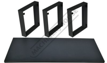
Optional Kick Board-Benchtop (T7690)