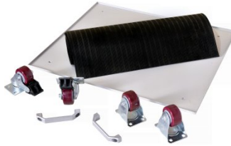
T7689 Cabinet Trolley Kit