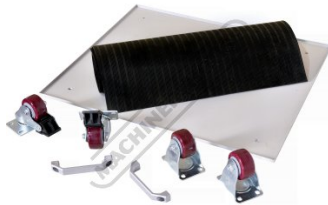
Optional Wheel Handle Kit