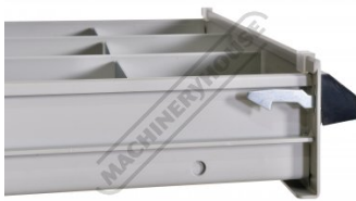
Safety Lock On Draws