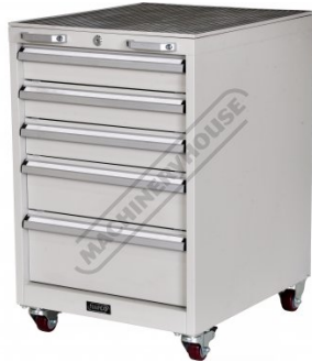
Shown With Optional Wheel Kit