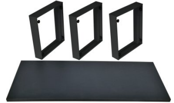
T7690 Bench Top & Kick Board Kit