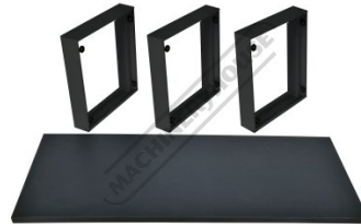
Optional Kick Board & Benchtop Kit