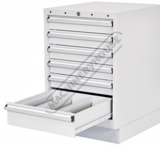
Large Lower Draw