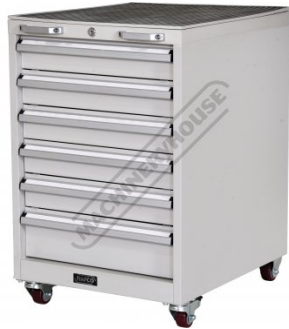
Shown With Optional Wheel Kit