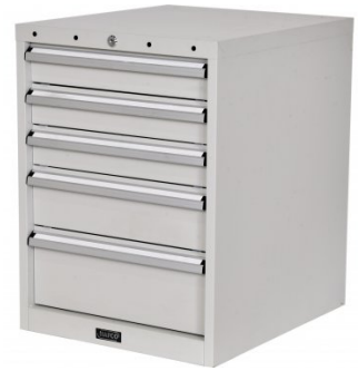
T7685 5 Drawer - Tooling Cabinet