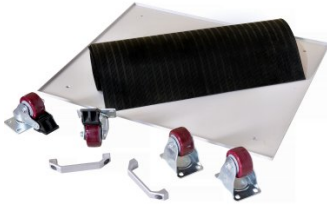
T7689 Cabinet Trolley Kit