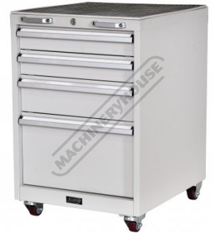
Shown With Optional Cabinet