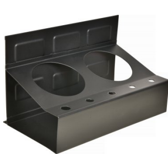
T703 Magnetic Spray Can & Screwdriver Holder