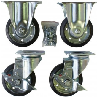
T776 Wheel Kit - Ø125mm