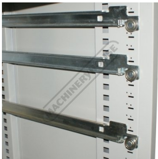
Heavy Duty Drawer Slides