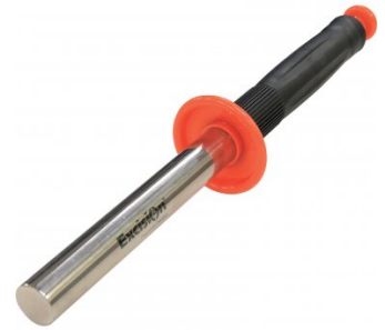
L300 Magnetic Swarf Remover