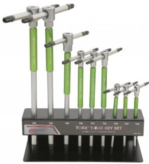
H822 Torx® Key Set with T-Bar Handle