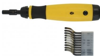
D060 Deburring Tool - Telescopic Shaft