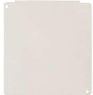
T788 Steel Divider