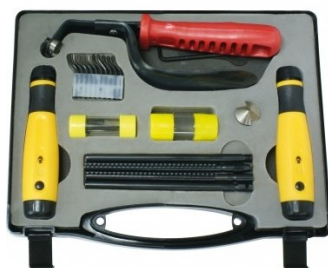
D065 Universal Deburring Tool Set - 23 Piece