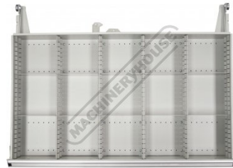
Heavy Duty Drawers