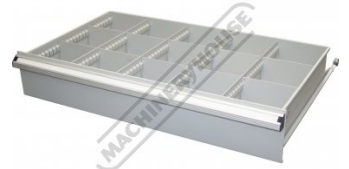
Drawers with Steel Dividers