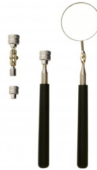
M0009 Magnetic Pick Up Tool & Inspection Mirror Set