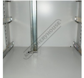
Drawer Locking Mechanism