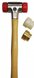
H870 Soft Face Hammer