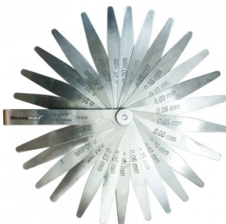
Q616 Feeler Gauge Set