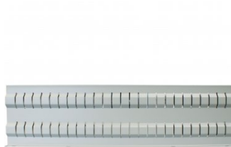
T787A Slotted Rail