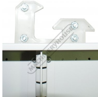
Drawer Lock Bracket