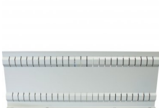
T788A Slotted Rail