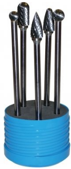
B905 Carbide Burr Double Cut Set - Long Series