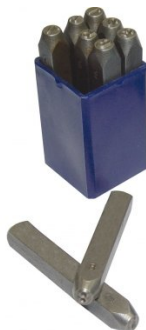
P355 Number Punches