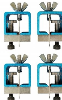
W113 Butt Welding Aluminium & Steel Clamp Set