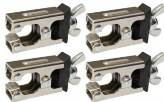
W112 Micro Welding Steel Clamp Set