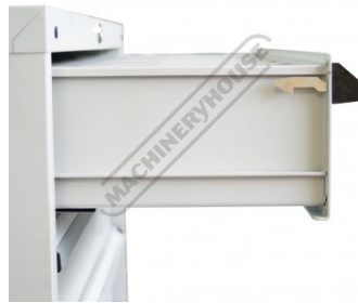
Drawers with Safety Lock