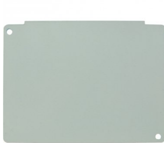
T787 Steel Divider