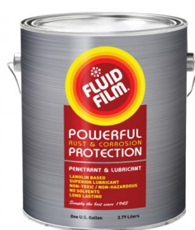
O044 Rust & Corrosion Preventive