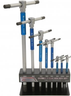
H820 Metric Hex Key Set with T-Bar Handle