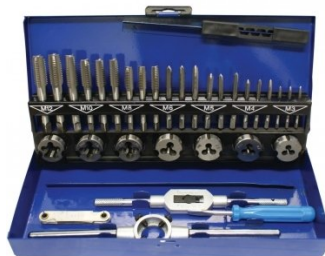
T012 Metric Alloy Steel Tap & Die Set - 32 Piece