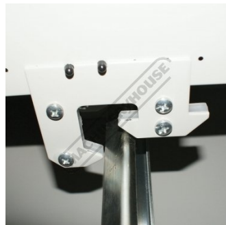
Drawer in Unlock Position