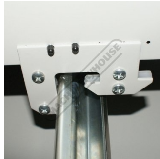
Drawer in Lock Position