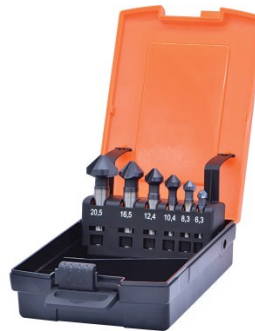
D1061 HSS Countersink Set (90° 3 Flute Type) - 6 Piece