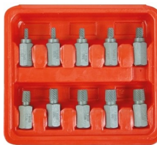
T870 Screw Extractor Set - 10 piece