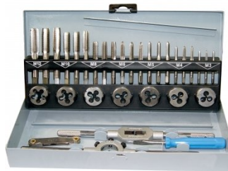
T013 Metric HSS Tap & Die Set - 32 Piece