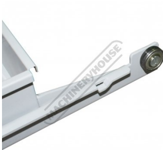
Drawer Ball Bearing Arms