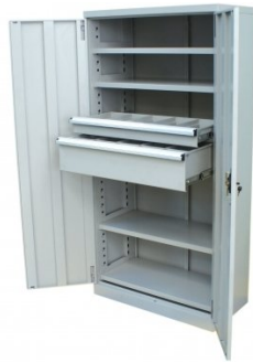
T762 Industrial Storage Cupboard