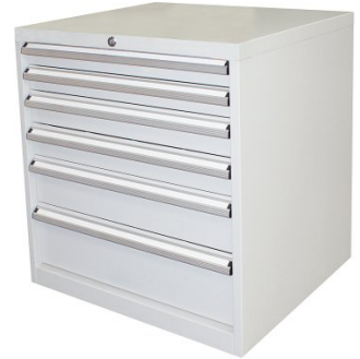
T767 6 Drawer - Industrial Tooling Cabinet