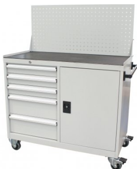
T773 Industrial Mobile Tooling Cabinet Workstation