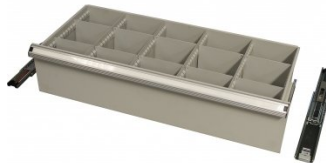
T762B Drawer with ball bearing slides