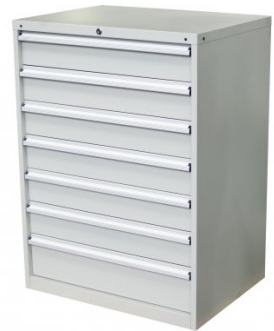
T772 7 Drawer - Industrial Tooling Cabinet