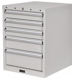
T7685 5 Drawer - Tooling Cabinet