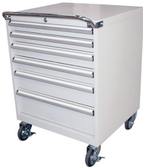
T768 6 Drawer - Industrial Mobile Tooling Cabinet