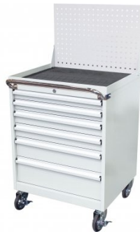
K068 6 Drawer - Industrial Mobile Tooling Cabinet with Backing Panel Package Deal