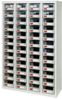
T7956 Parts Storage Bins