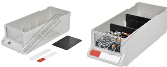
Parts Bin Dividers and Name Tags Parts Bin 90 x 218 x 70mm