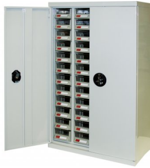
T7958 Parts Storage Bin Cabinet