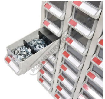
Drawer with Dividers Shown with Parts