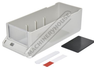
Parts Bin Dividers and Name Tags