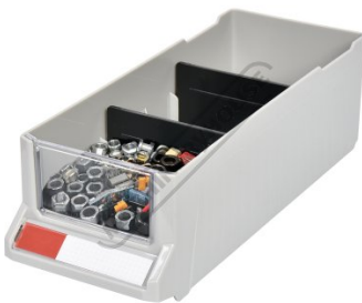
Parts Bin 90 x 218 x 70mm