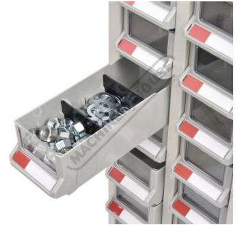
Drawer with Dividers Shown with Parts