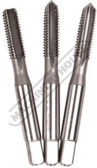
Starter Intermediate & Plug Tap