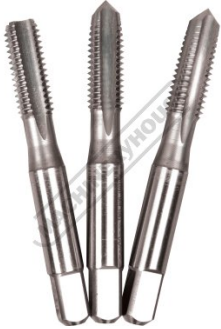
Starter Intermediate & Plug Tap