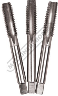
Starter Intermediate & Plug Tap